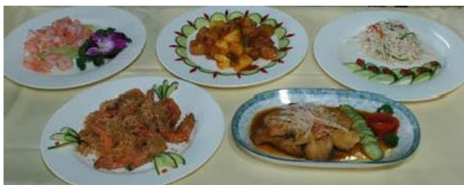
Fig.1 The dishes auto-cooked by the machine