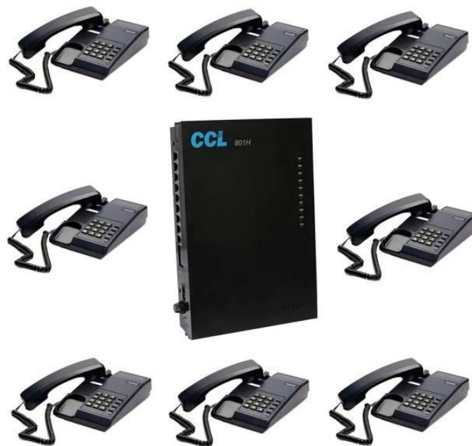
Figure 2. Setup of the Study

access in the case of an emergency—like a fire or medical emergency—is one of the best methods to improve security. Generally speaking, a hardwired intercom system installation improves communication, efficiency, and safety. The results make it very evident that wired intercom systems are the better choice for guaranteeing the security and dependability of internal communication in both home and business environments. A more thorough examination of the findings will be given by briefly discussing the following points: Regarding dependability and safety, the wired intercom system far outperforms its wireless equivalent. Reliability and consistency of the signal are proof that wired systems resist degradation and interference better than wireless ones. Higher protection is provided by using encryption methods and physical connections, which is particularly helpful when security is critical. Encouraging the Users' Experience Users have given such wonderful feedback that it is quite evident how crucial a user-centered design approach is. Intercom station placement done well and an intuitive interface implemented can result in a good user experience.