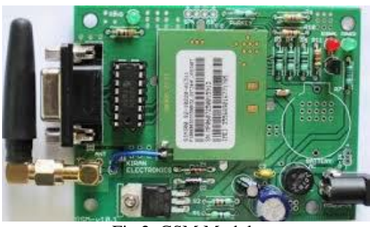
Fig.2. GSM Module

It operates at 900 MHz or 1800 MHz frequency band. Many GSM network operators have operates with roaming agreements with the foreign network operators, often users can also continue to use their mobile phones when they travel to other countries. SIM cards (Subscriber Identity Module) containing home network access configurations, it may be switched to those will meter local access, significantly reducing roaming costs while experiencing no reductions in service.