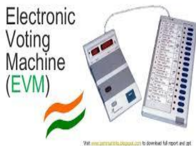
Fig.3. Electronic voting machine

During the counting of votes, the results are displayed by pressing the 'Result' button. The result button cannot be pressed till the 'Close' button is pressed by the Polling Officer in-charge at the end of the voting process in the polling booth and the button is hidden and sealed; this can be broken only at the counting centre in the presence of designated office.