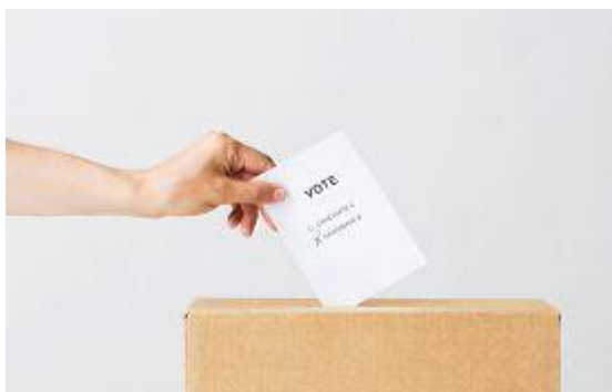
Fig.1. Paper Ballot