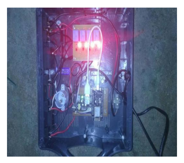
4. Devices ONFigure 5 Outputs