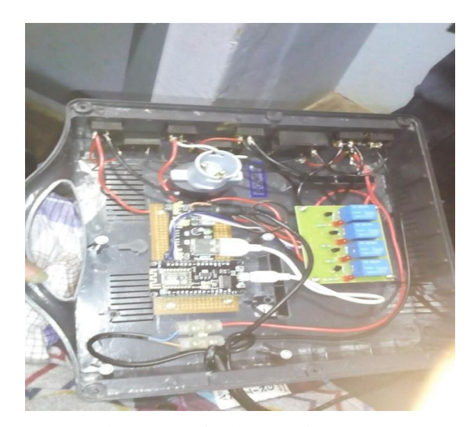
Figure 4 IoT implementation setup.

Here we are having two modes of operations such as manual as well as automatic mode of operation. During the manual mode we can directly ON and OFF the off the appliances, similar to that during the automatic mode of operation we can control the office appliances from anywhere. The outputs are,