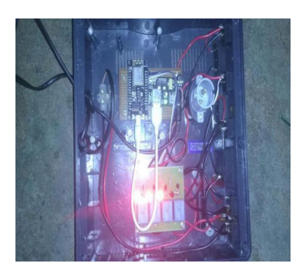
3. Devices ON