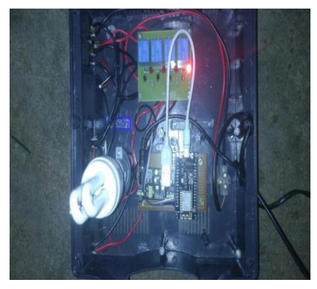
1. Device ON

Here we are having two modes of operations such as manual as well as automatic mode of operation. During the manual mode we can directly ON and OFF the off the appliances, similar to that during the automatic mode of operation we can control the office appliances from anywhere. The outputs are,