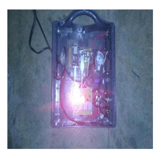
2. Devices ON