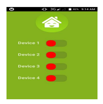
Figure 2 Android applications

Using the android smart phones as a transmitter is a wise solution because it provides easy appearance and user friendly too. It provides a simplified process of controlling the office appliances [13-27]. But we cannot directly control the office appliances which are connected to the cloud network, for that purpose we need an Android application.