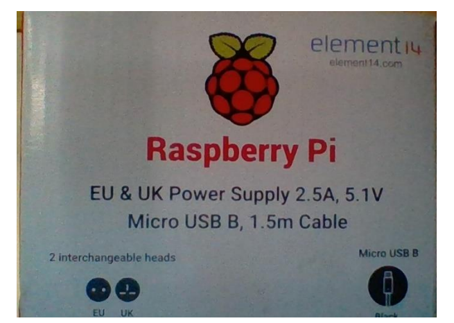
System Output Using Product Image