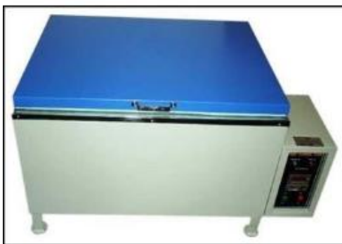
Fig.2. Accelerated curing tank used in laboratory for concrete testing

Determining Concrete Compressive Strength By Accelerated Curing Test (IS: 9013) As per BIS (IS 516) the compressive strength of a concrete mix is determined by curing concrete cubes (150mm) for 28 days, temperature maintained at 27+/- 2 deg Celsius. The test will be determines the grade of concrete. But under special requirements (time constraints) to determine grade of concrete it may not be feasible to wait as long as 28days, BIS recommended accelerated curing test to determine the grade of concrete in about in 28hrs, governed by IS: 9013. Although, indicative strength can be achieved by testing the cubes after 3days (50% of 28 days strength) and 7days (60% of 28 days strength) and 7days (60% of 28 days strength) from casting, a more standard method is commonly called accelerated curing test. Accelerated curing is a method used to get high early compressive Strength in concrete structure. Accelerate curing is mostly used in precast industry where high early strength. Accelerate curing is mostly used in precast industry where high early strength reduces cost, by decreasing the formwork removal time, also repair works are accelerated curing, in order to make its functional at early age. Raising the temperature of curing water speeds up the cement hydration process, thereby both curing of concrete and achieving high early compressive strength.